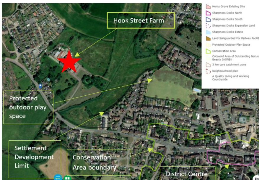
Image 1 – Extract of Stroud District Council Policies Map

The site is well located in relation to the existing settlement of Berkeley, lying just to the west of the settlement boundary (see Images 1 and 2 ). To the south is agricultural land and residential properties on Lynch Road (including a site recently developed for 10 affordable houses on Butler Close to the south east of the site and a community meadow (Sarah’s Field). To the west is a residential Park Home site (Berkeley Vale Park). To the north is agricultural land and the east is the edge of the settlement of Berkeley, with properties on James Orchard forming the boundary with the site (see images 2 and 3 ).