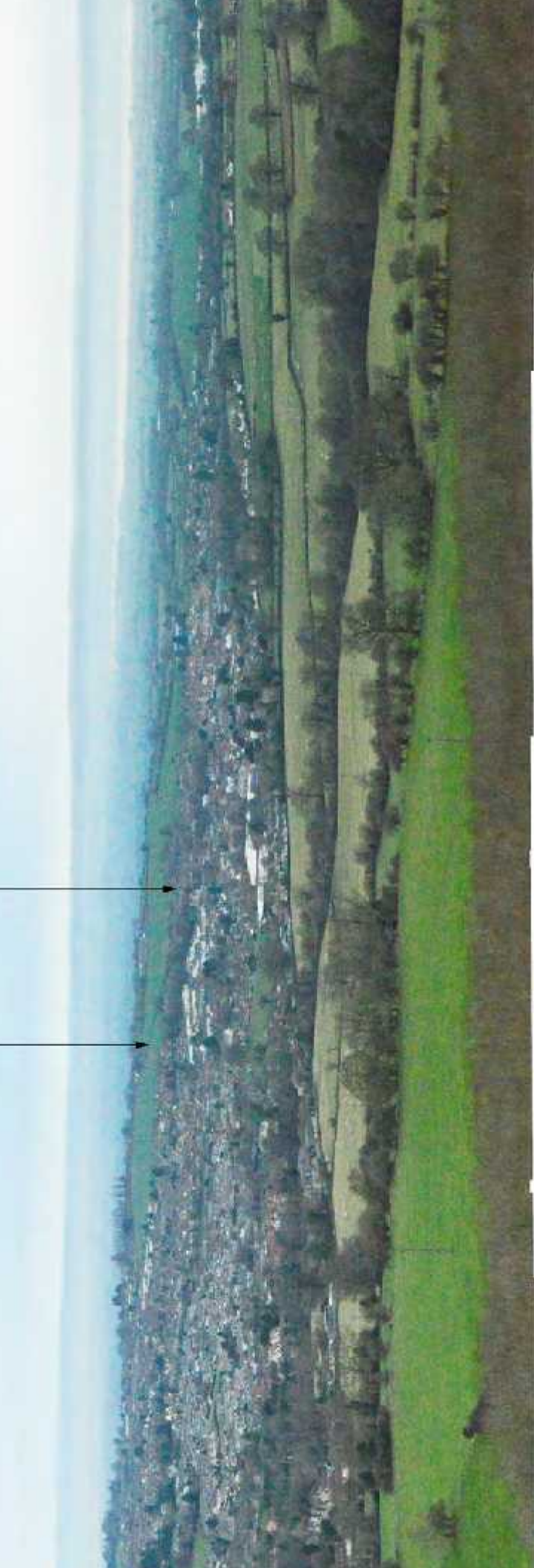
Approximate direction of the site and wider setting of Lower Cam located beyond intervening vegetation