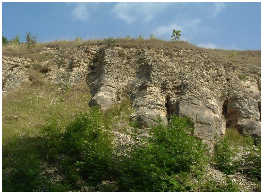
Left: An outcrop of oolitic limestone in the Avening Valley. The rubblestone and freestone layers can be clearly seen.