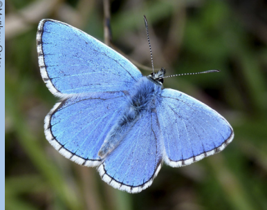
Adonis Blue, male

Gloucestershire has lost 80% of its wildflower-rich limestone grassland in the last 30 years. It is therefore essential that we protect places such as the Commons in order to prevent any further decline.