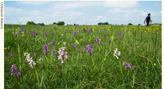
Early Purple and Green-winged orchids on the Commons