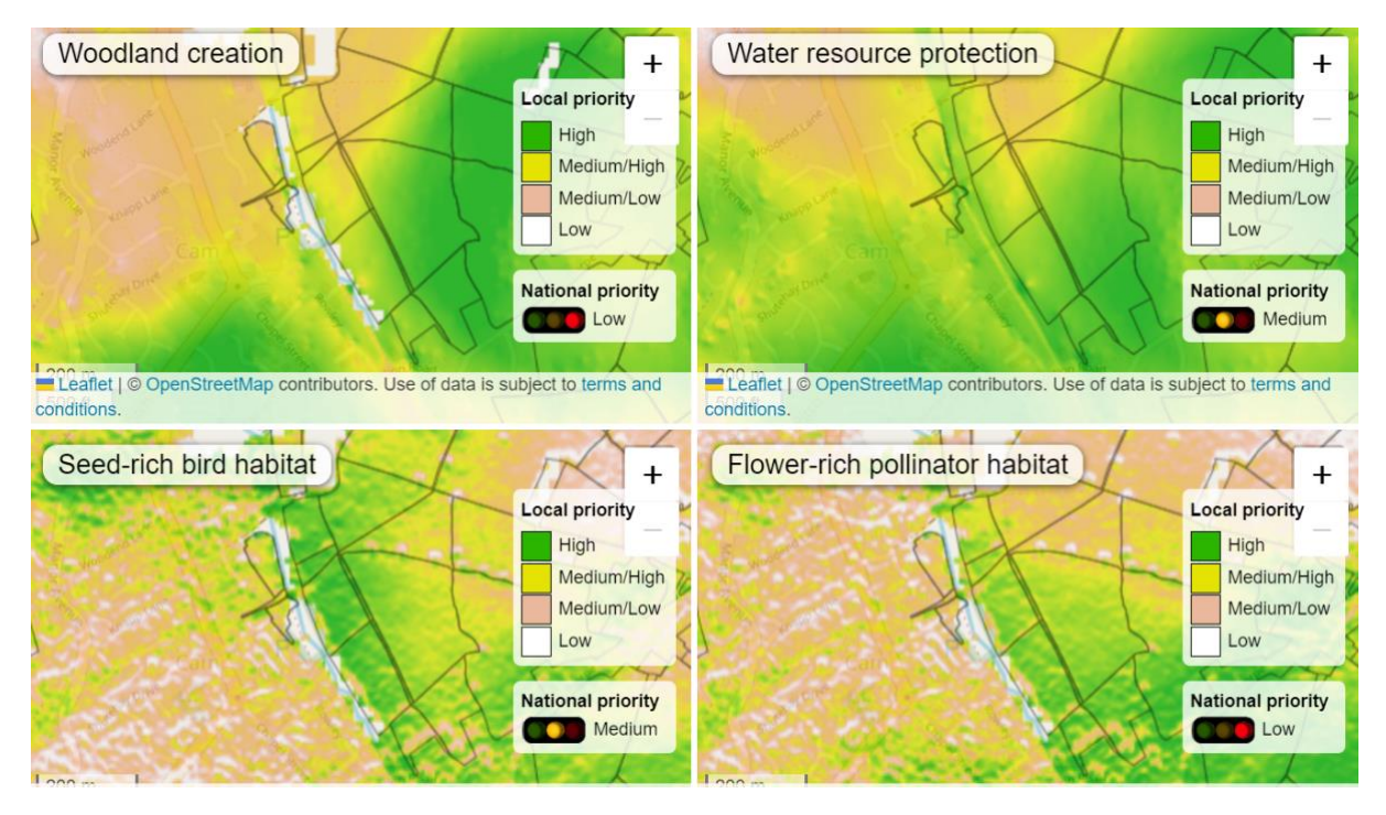
Figure 3 Extract from Centre for Ecology and Hydrology (CEH) e-planner showing the PS25 area (and wider area to east) as a local priority for woodland creation, water resource protection, seed-rich bird habitat and flower-rich pollinator habitat.

Figure 2 Extract from Gloucestershire Natural Capital Mapping Project managed by Gloucestershire Local Nature Partnership (GLNP) showing majority of PS25 designated for woodland opportunity in the Nature Recovery Network