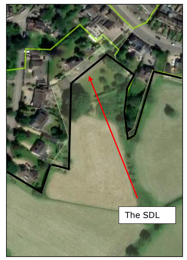
Policy Map for Stroud Local Plan

As shown on the below policy map for the Stroud Local Plan (the Black Line - SDL) the SDL cuts through the garden and rear of this property, the intention of this representation is to move the boundary in line with the boundary of the property, so that it is consistent with the applicants private land ownership shown below in red with the yellow dotted line indicates the altered SDL. The proposed amendments would also ensure the SDL align with features on the ground.