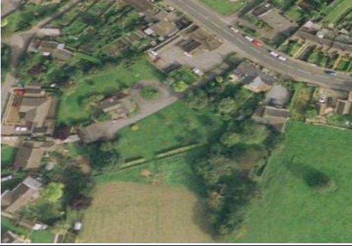
Aerial Photograph of the Site