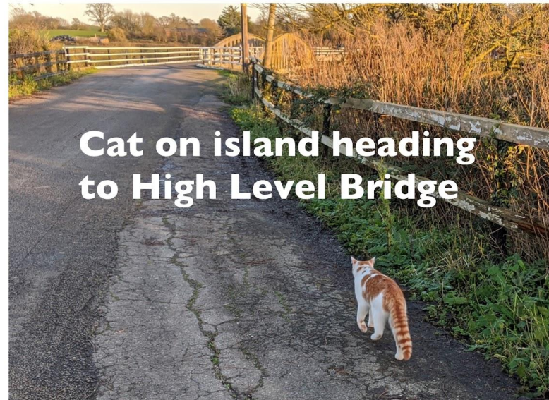
Cats wandering on Sharpness Dock island area