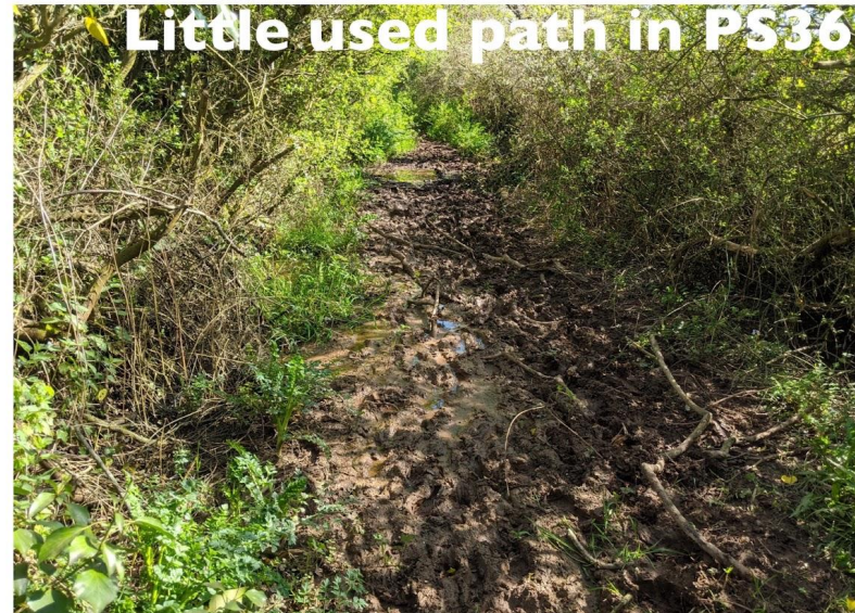
Poorly drained, wet muddy land almost everywhere in Berkeley Vale