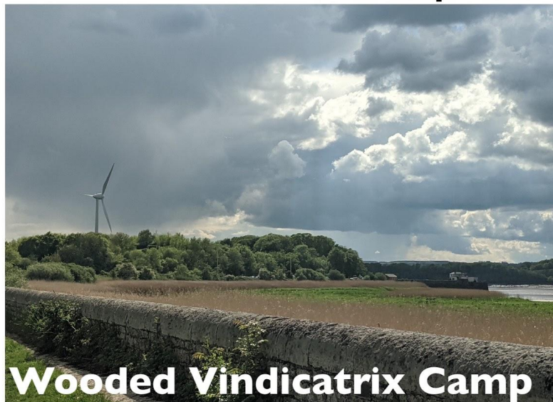
Wooded Vindicatrix Camp