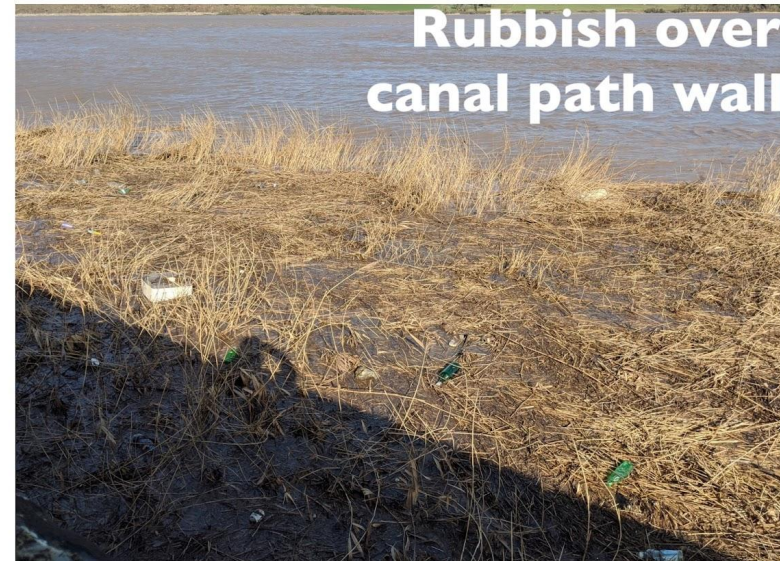
High tide roost by the canal & litter everywhere for miles at high tide