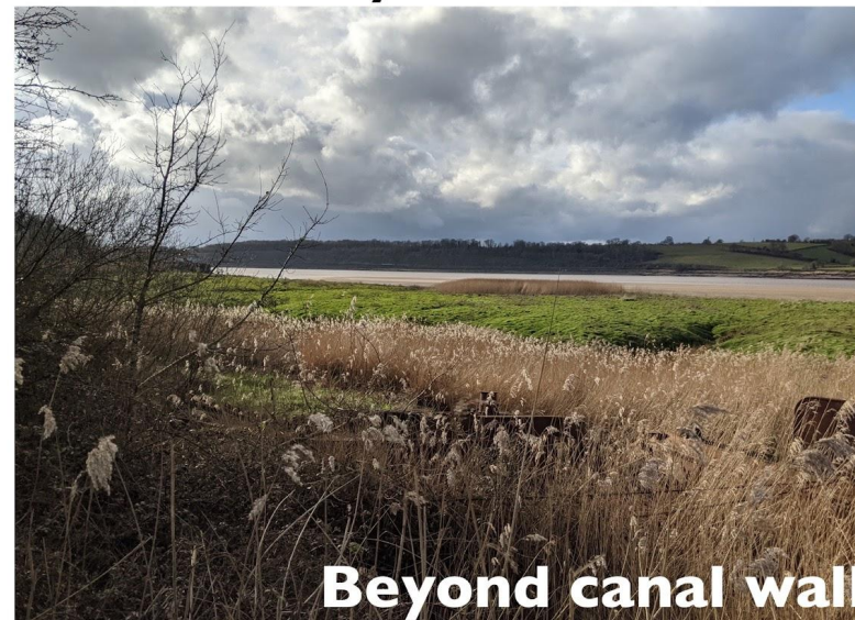
Beyond canal wall