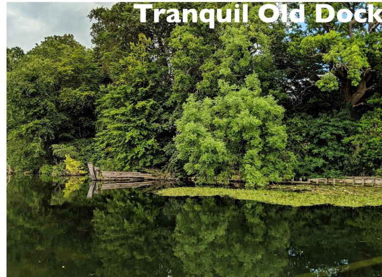
Tranquil Old Dock