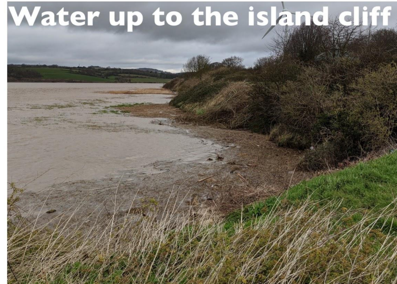
Sharpness Dock area around spring high tide without storm surge