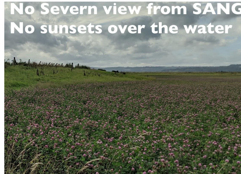
SANG & reserve in fluvial & tidal flood zones below embankment