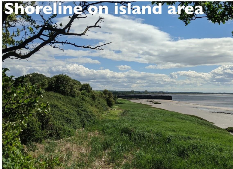
Shoreline on island area