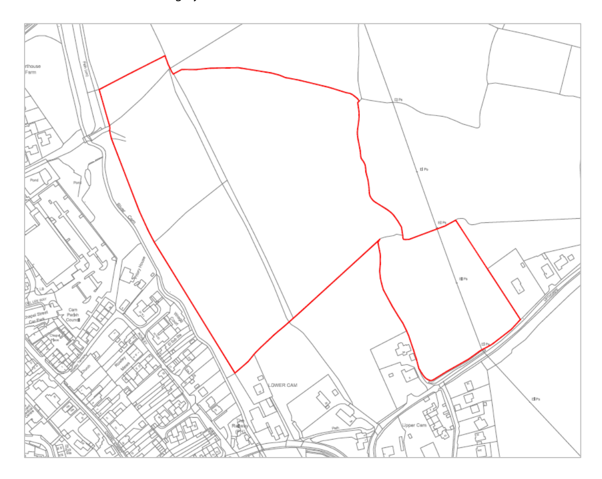
Figure 1. Location Plan, land north of Upthorpe, Cam

8.2.1 Gladman are promoting land north of Upthorpe, Cam for residential development and associated community infrastructure. A location plan for this site is included below as Figure 1. This site forms part of the proposed allocation PS25 'East of River Cam'. Consequently, Gladman are supportive of proposed allocation PS25, however would recommend that this allocation is extended to include all of the land shown in Figure 1. Extending the proposed allocation would make the most efficient use of land, provide a suitable access to the site and help to deliver much needed housing in Stroud. This extension to the proposed allocation is logical and would add the ability to deliver a greater number of homes in this highly sustainable and suitable location.