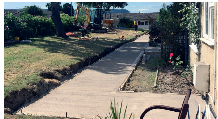
Construction of the mobility scooter-friendly path

Building work at Sherborne House in Stonehouse is now well underway. Our contractor Beard has started plastering the communal corridors, renovating the entrance making it larger and brighter, re-modeling the communal lounge and kitchen areas and constructing the mobility scooter path outside. These improvements will make the space open plan and much more versatile for the many activities that are undertaken in the lounge and the external works will improve accessibility to residents' homes.