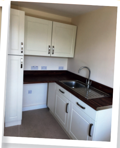
Left: Denise Lee moving into her new flat in Grange View. Above: The kitchen and bathroom in the former scheme manager's home in Grange View.