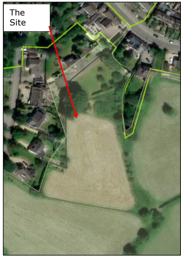
Policy Map for Stroud Local Plan

Dursley is a very large settlement and is one of the District's historic market towns. Dursley has a strong 'strategic' retail role as one of the District's five town centres. It offers a very good level of local community services and facilities (GP, dentist and pharmacy, post office, primary schools and pre-schools, places of worship, pubs, town hall/community centre, sports/playing fields and playgrounds) and has an important role in providing a diverse range of 'strategic' services and facilities to a wider catchment (hospital, banks, secondary school and 6th form, library, swimming pool and leisure centre). Dursley has along with Cam) the best access to key services and facilities of anywhere in the District. The town has an important employment role and also functions as a 'dormitory' settlement and strategic service centre.