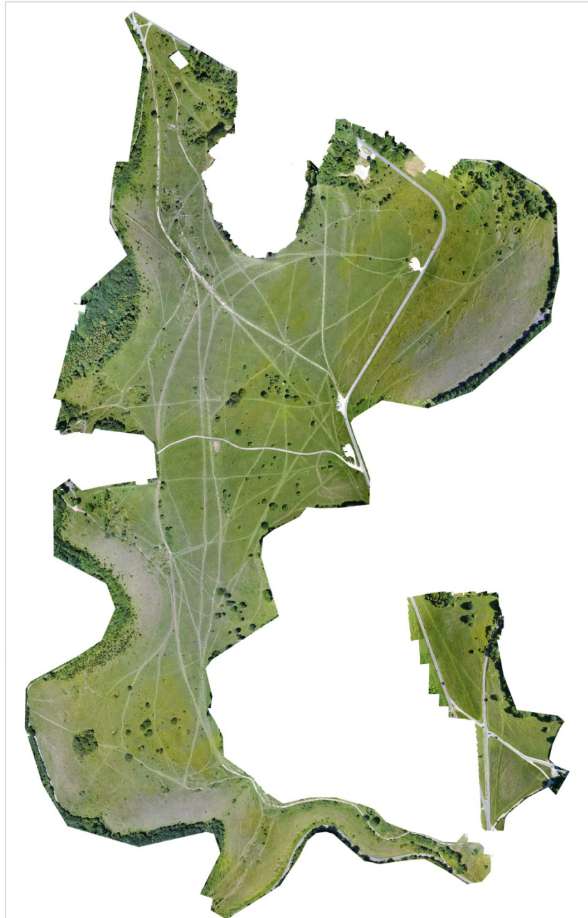
Above: Rodborough Common SAC – summer 2017

The aerial image shown below was taken over Rodborough Common this summer – and is referred to in our response to question 1.0b above. It represents additional local data, and illustrates the pressures on this particular European designated nature conservation site based on current visitor footfall.