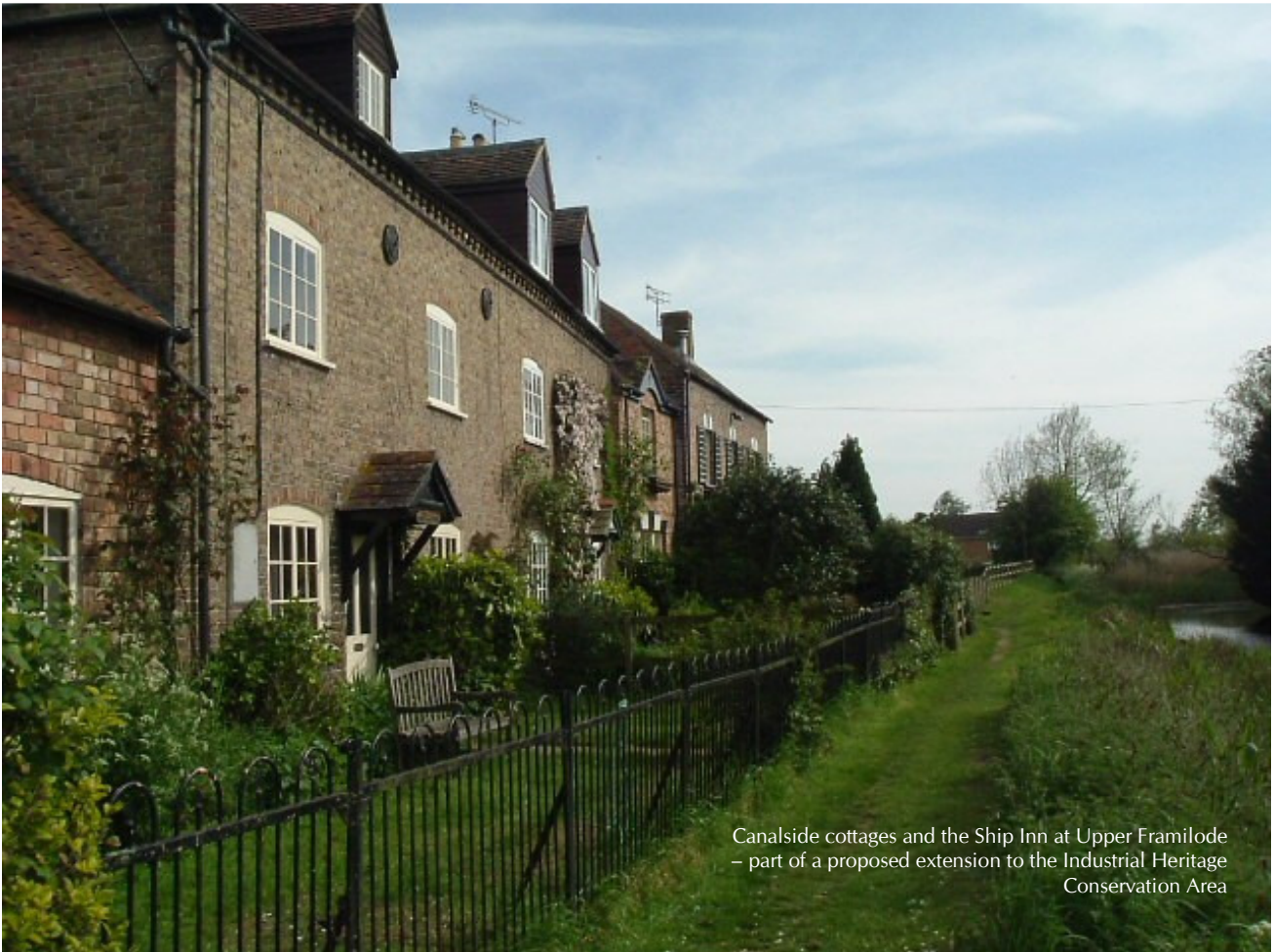
Canalside cottages and the Ship Inn at Upper Framilode – part of a proposed extension to the Industrial Heritage Conservation Area